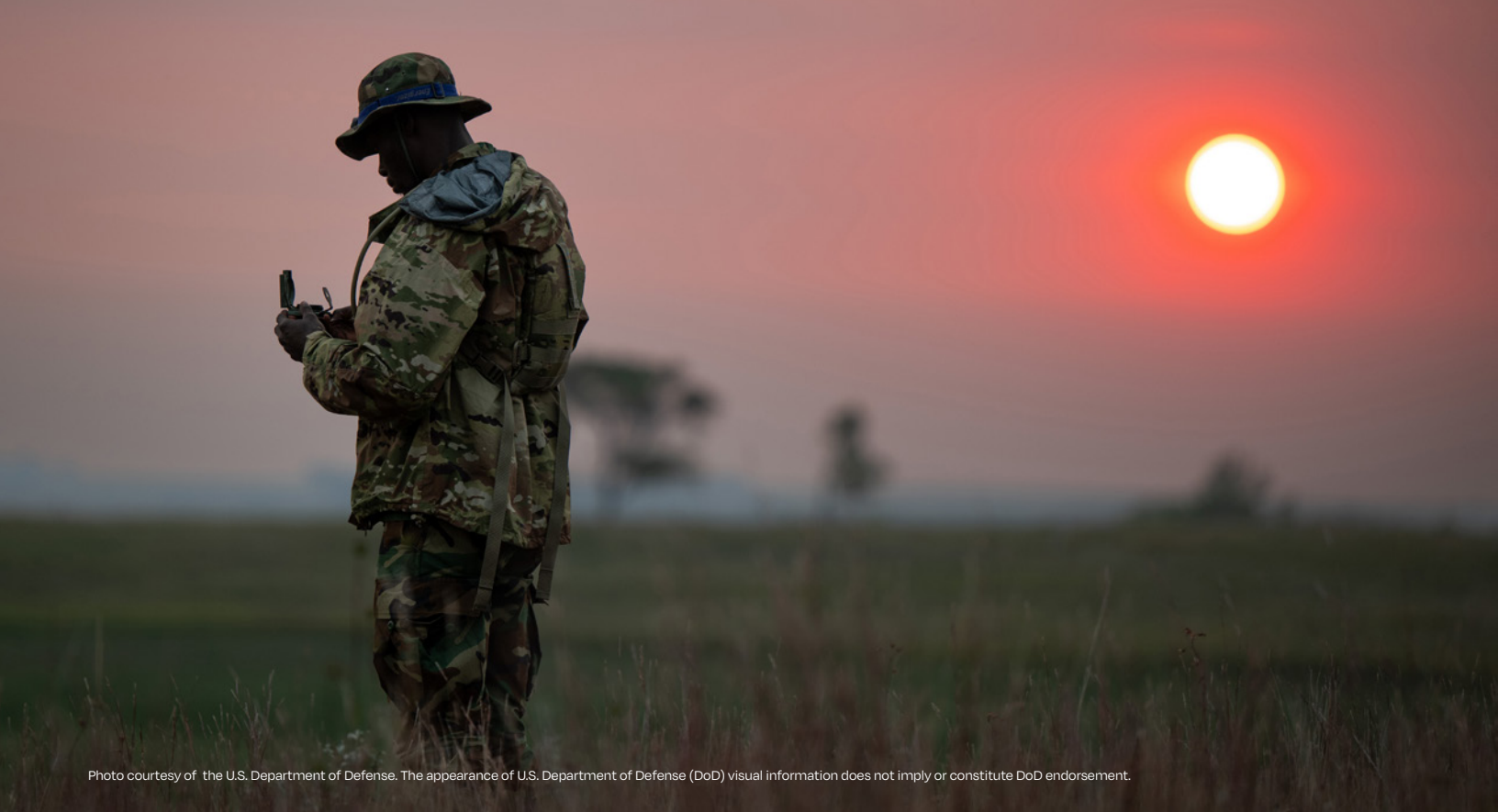
Photo courtesy of the U.S. Department of Defense. The appearance of U.S. Department of Defense (DoD) visual information does not imply or constitute DoD endorsement.

Opioid addiction and overdose are particularly concerning issues related to brain injury. Opioid use can cause brain injury when someone overdoses and experiences a lack of oxygen to the brain, causing an anoxic injury. Additionally, individuals with brain injury are more likely to become addicted to opioids than their peers without brain injury. 18 TBIs often result in headaches and orthopedic injuries, leading to prescriptions for opioids. Seventy to eighty percent of all patients with a TBI are discharged with a prescription for opioids. 19 A Traumatic Brain Injury Model Systems (TBIMS) study indicated that individuals with TBI were 10 times more likely to die from accidental poisoning than the general population. Further, this study found that 90 percent of accidental overdose deaths were drug related: 67 percent were from narcotic drugs, 14 percent from psychostimulants, and 8 percent from alcohol. 20