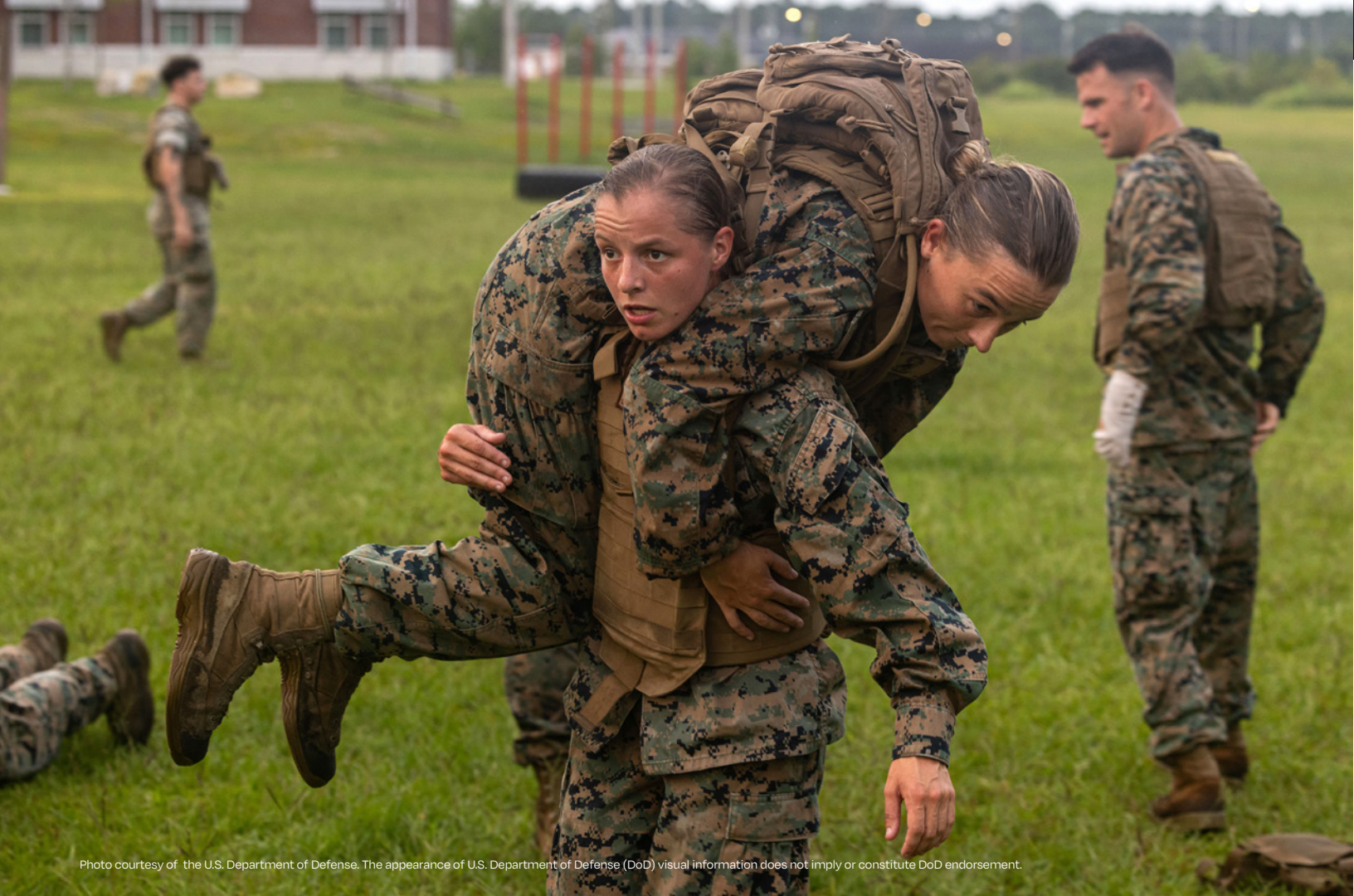
Photo courtesy of the U.S. Department of Defense. The appearance of U.S. Department of Defense (DoD) visual information does not imply or constitute DoD endorsement.